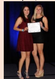
Second Place: Concrete Canoe (Women’s Sprints & Women’s Slalom/Endurance Race).

Our SDSU team also won 2 nd place in Race Points; 3 rd place in Concrete Canoe Coed Sprints, & Men’s Endurance! Additional photos are featured on our Current Events page here: