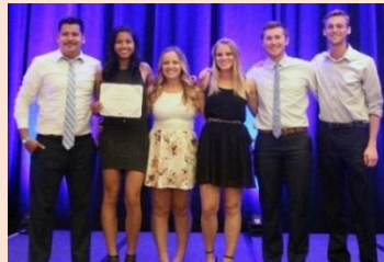
Second Place: Volleyball, &