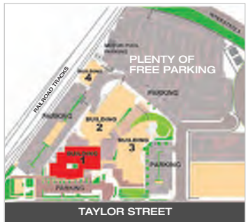
4050 TAYLOR STREET, SAN DIEGO (Building 1)